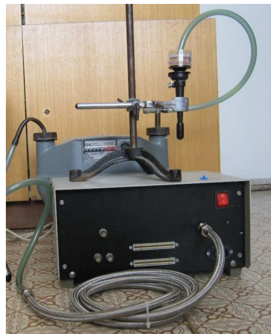
1 – dusty air, 2 – cyclone, 3 – filter, 4 – volume flowmeter, 5 – high-volume pump, 6 – analytic scales